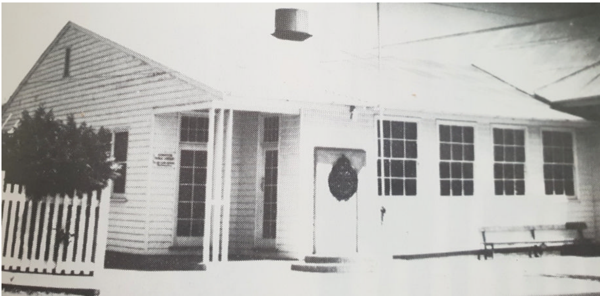
Victoria Hall 1956

An addition was made to the hall in 1956 and the library, which didn't have a permanent home, was housed there. The war memorial was built at this time. Later the rooms were used as a doctors surgery and now it is the home of the Brighton Green Ponds RSL sub branch.