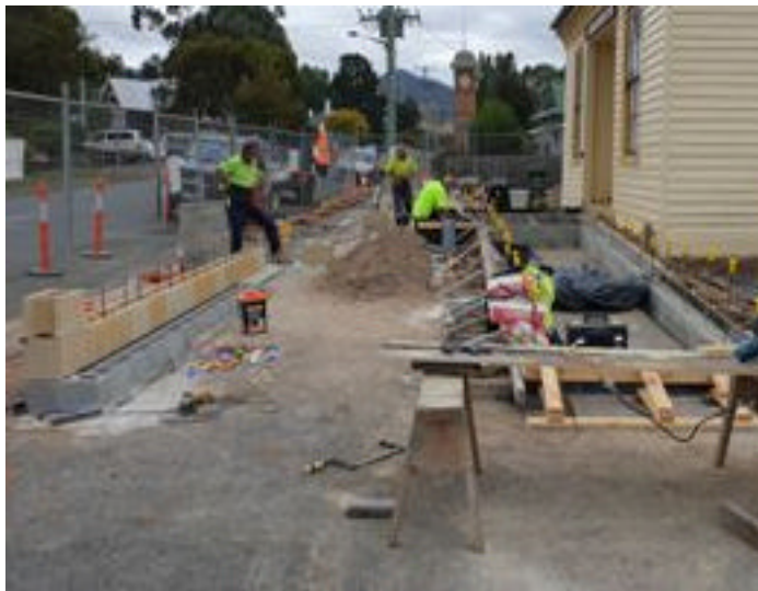
Above, the renovations began early February 2021 and below, nearing completion.

Disabled parking is at the side of the hall in Old Hunting Ground Rd.