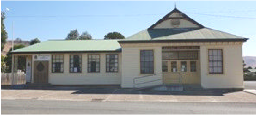
Victoria Hall before the renovations began. Sometime along the way the front porch was removed...possibly to make way for the access ramp. In 2020 the Kempton Streetscape Committee was awarded a government community grant towards updating the hall providing better disabled access, paving, lighting, and seating .